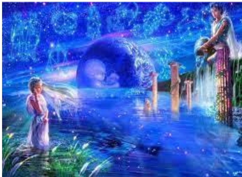
Painting by Condias Neigh