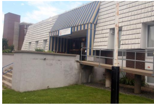
Main Entrance, Lachine Legion Hall

As club members know, the COVID-19 pandemic, and the fallout from same, has impeded our ability to hold a club meeting in an actual meeting hall for over three years. We are now pleased to announce that MonSFFA will return to a regular, in-person meeting schedule beginning with our August 12, 2023 get-together!