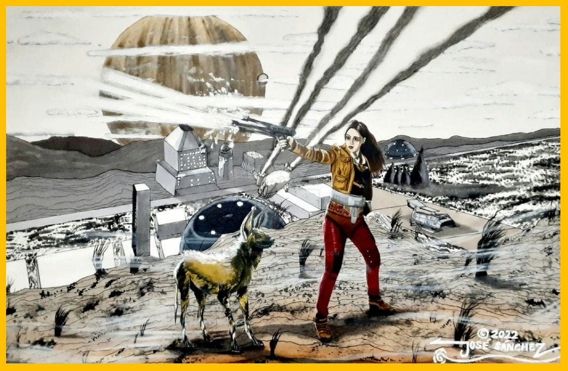
Springtime war games in the Valles Marineris