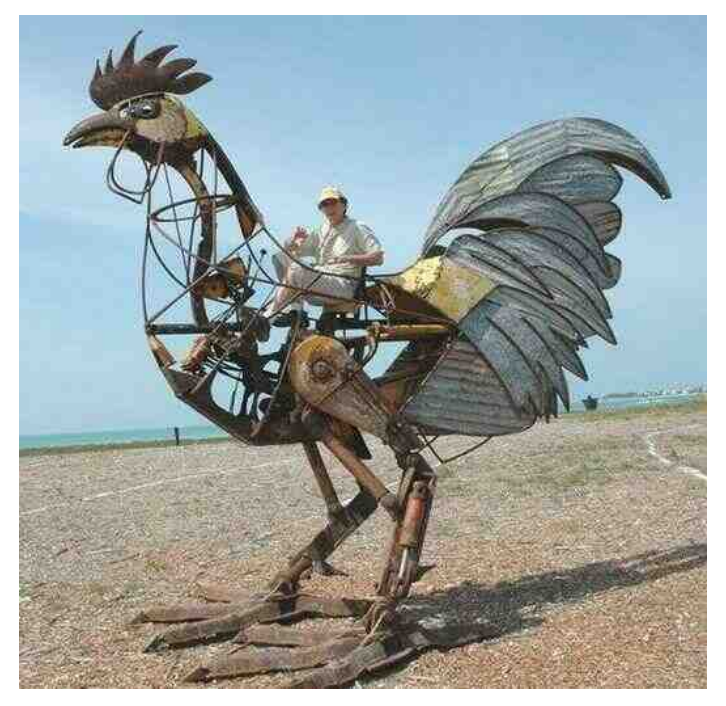
If I had a car, this might be it