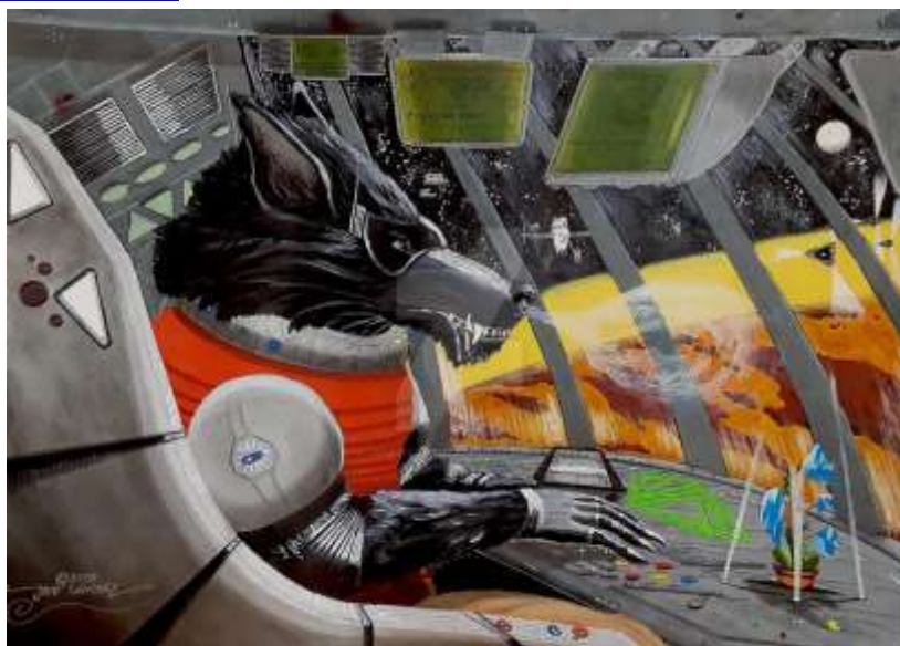
On Course... (aka Space Wolf)