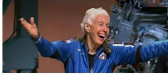
Aviation pioneer Wally Funk, the oldest person to fly in space