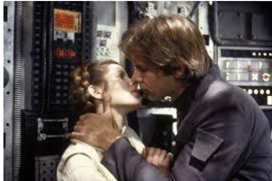
When the science is not so hard

Scientific Romance is an archaic, mainly British term for the genre of fiction now commonly known as Science Fiction. The term originated in the 1850s to describe both fiction and elements of scientific writing, but it has since come to refer to the science fiction of the late nineteenth and early twentieth centuries, primarily that of Jules Verne, H.G. Wells and Arthur Conan Doyle. In recent years the term has come to be applied to science fiction written in a deliberately anachronistic style as a homage to or pastiche of the original scientific romances.