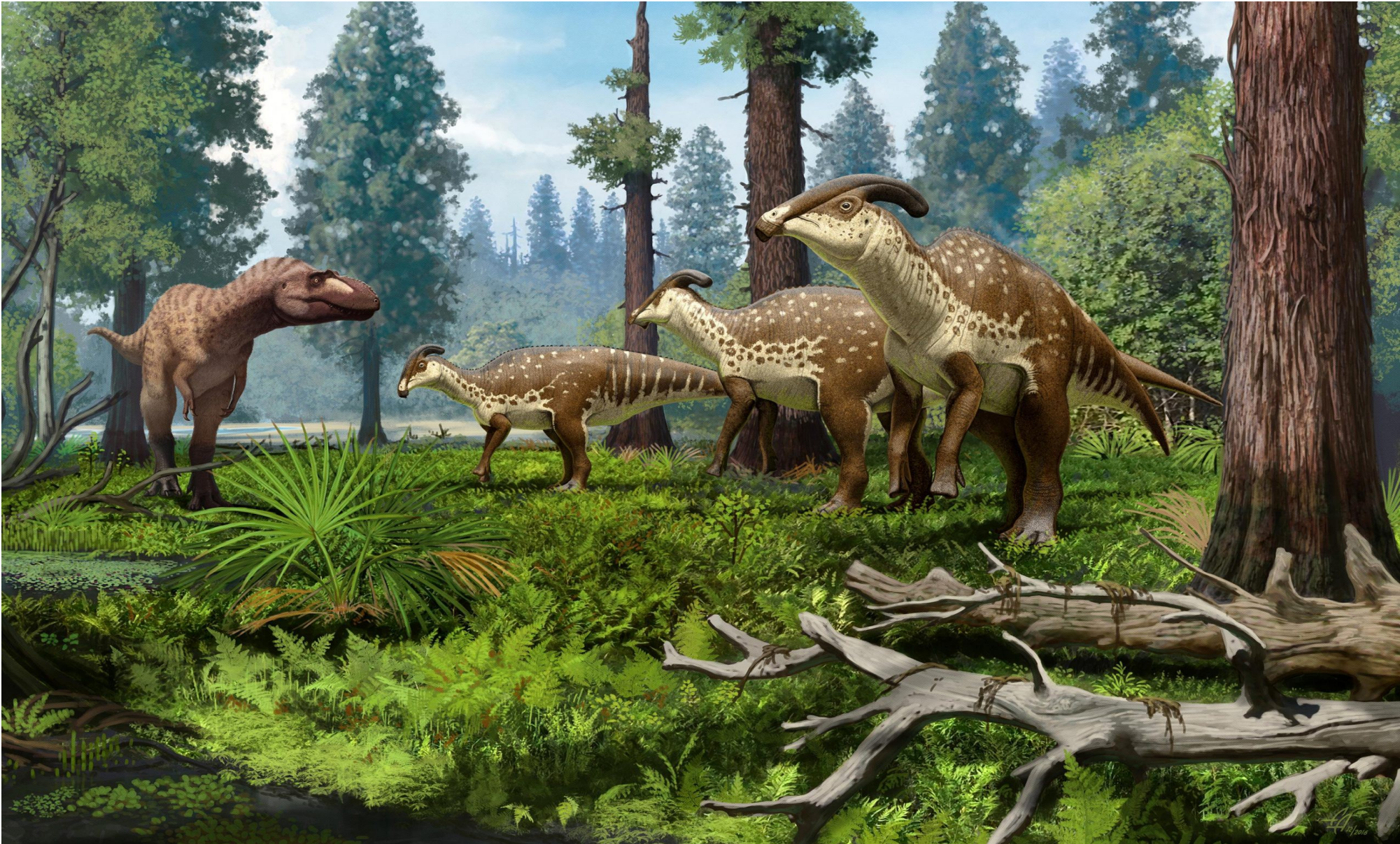
Parasaurolophus-group-threatened by a tyrannosaur © Doug Shore, Denver Museum of Nature & Science

January 2021, Issue 502, Volume 46, Number 1