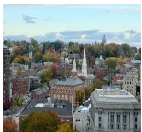
Aerial view of Providence