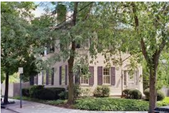
Home of H.P. Lovecraft