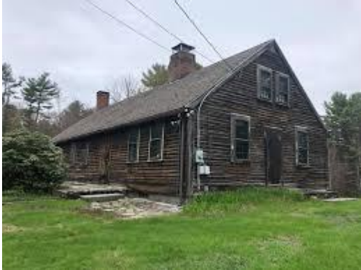
Original house of THE CONJURING

Happenings in the non-computerized world