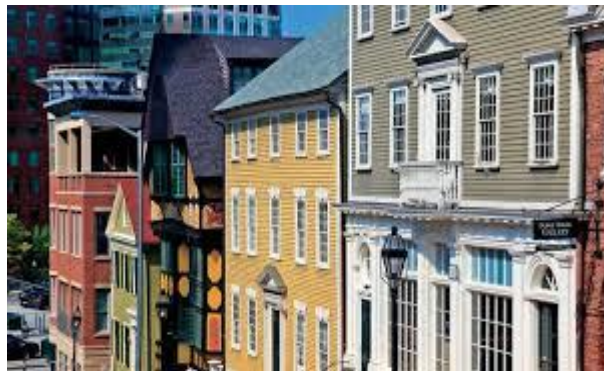
View of an area of Providence