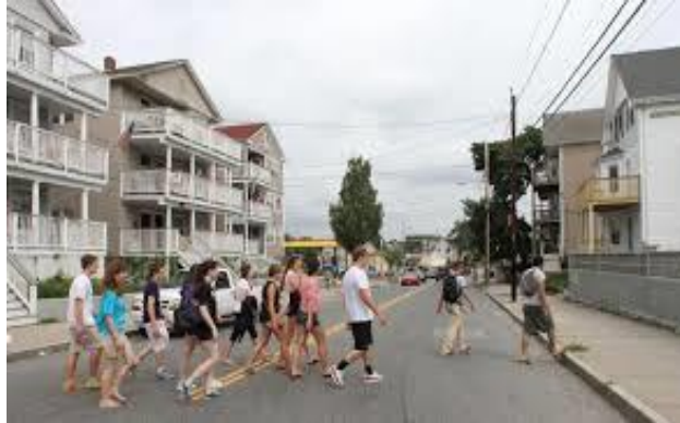
College students in Providence, Rhode Island