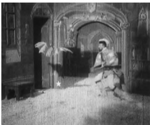
Illustration 31: House Of The Devil (1896)

A note on the cover. Some images are vintage Hollywood Pin-ups and there are also early 20 th Century home made Halloween costumes. Now those are scary!