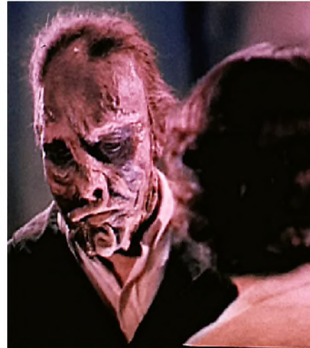
Illustration 21: Atwill Unmasked

Murders In The Rue Morgue (1932) Bela Lugosi performs horrible experiments in Paris. Pretty unsettling at times.