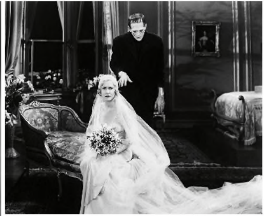
Illustration 8: Frankenstein 1931