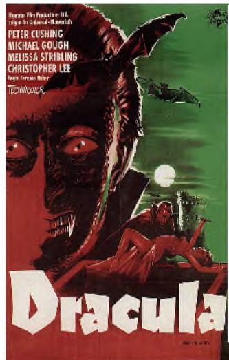
Illustration 13: Horror Of Dracula (1958)