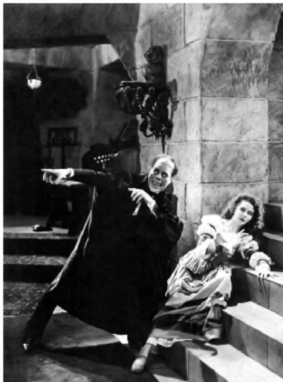
Illustration 24: Phantom Of The Opera (1925)