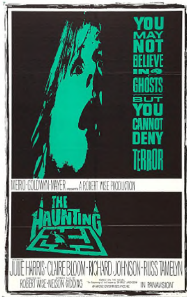
Illustration 10: The Haunting (1963)