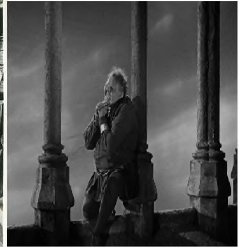
Illustration 12: Quasimodo played by Charles Laughton (1939)

Haunting, The (1963) One of the scariest, no blood nor gore. Just very unsettling. And look out for nightmares.