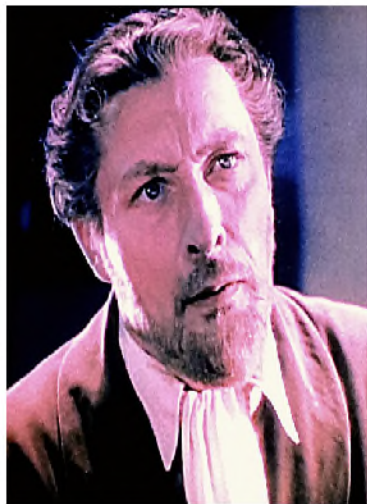
Illustration 22: Lionel Atwill