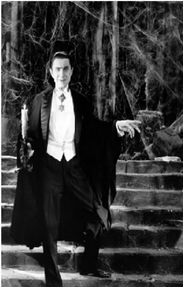
Illustration 6: Dracula 1931