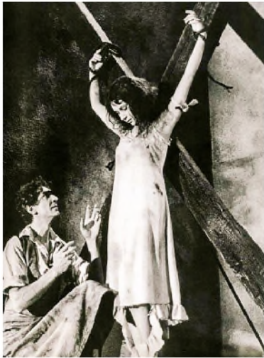
Illustration 20: Murders In The Rue Morgue