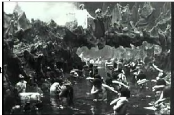
Illustration 4: Dante's Inferno

Donovan's Brain (1953) Scientist attempts to preserve the brain of a ruthless financier. Big mistake. From the novel by Curt Siodmak.