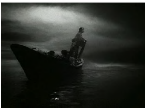
Illustration 29: Ugetsu (1953)

Uninvited, The (1944) Excellent, very moody ghost story.