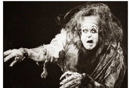
Illustration 9: Frankenstein 1910 Charles Ogle as the Creature

Dracula (1931) Bela Lugosi in the role of a lifetime. Dracula's Daughter (1936) Gloria Holden Dracula: Dead And Loving It (1995) Mel Brooks