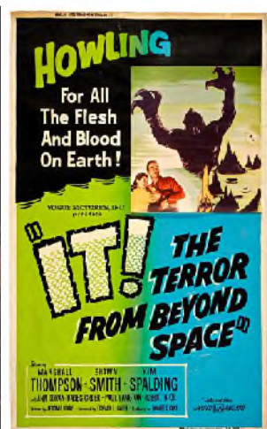
Illustration 16: It! The Terror From Beyond Space (1958)

I Married A Monster From Outer Space (1958) The title sounds like something from True Confessions magazine, but this is actually a spooky thriller. Aliens invade Earth by possessing the bodies of innocent humans. A cross between Invasion Of The Body Snatchers and John W. Campbell's Who Goes There.