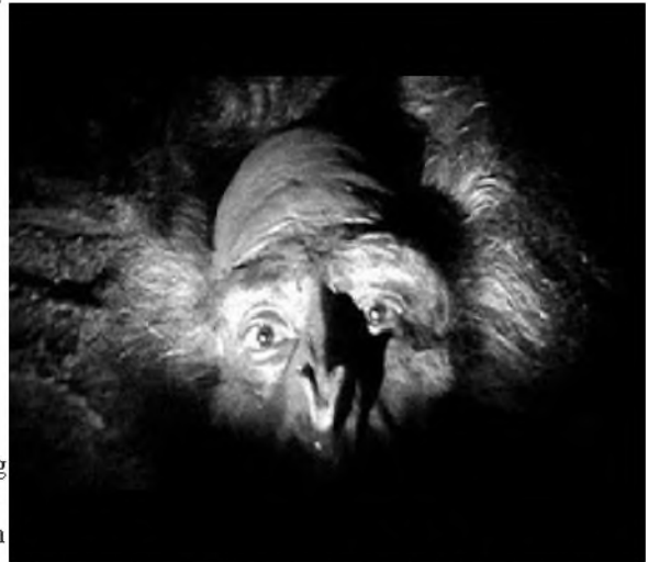
Illustration 1: The Abominable Snowman

Burn, Witch, Burn (1962) From Fritz Leiber, Jr's Conjure Wife