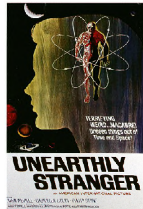
Illustration 28: Unearthly Stranger (1963)