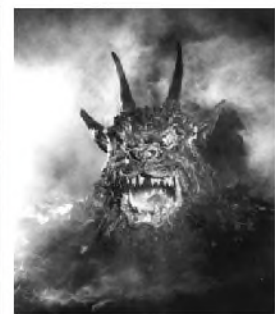
Illustration 5: Curse Of The Demon