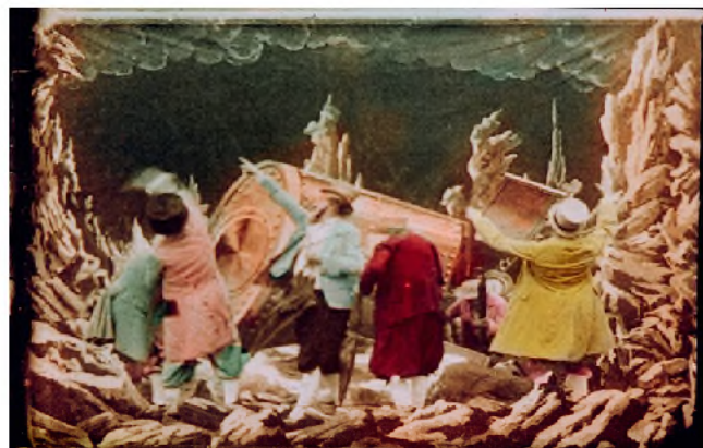
Illustration 30: A Trip To The Moon (1902)