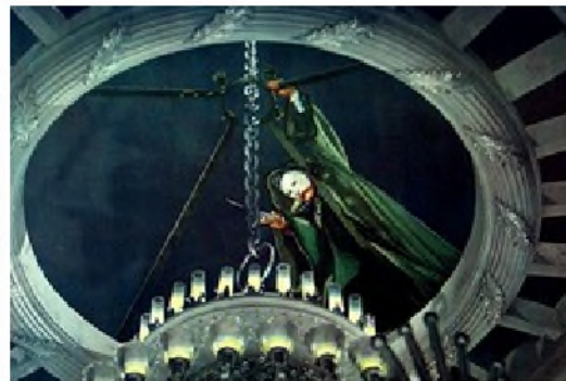
Illustration 26: Phantom Of The Opera (1943)