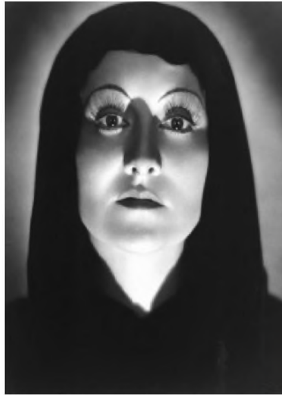
Illustration 7: Dracula's Daughter