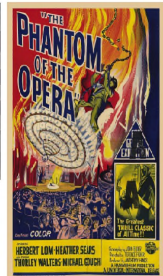
Illustration 25: Phantom Of The Opera (1962)

Salem's Lot (1979) Based on the Stephen King novel.