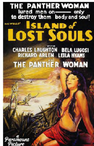
Illustration 15: Island Of Lost Souls (1932)