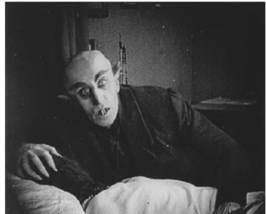
Illustration 23: Max Schreck in Nosferatu

Old Dark House, The (1932) Omen, The (1976)