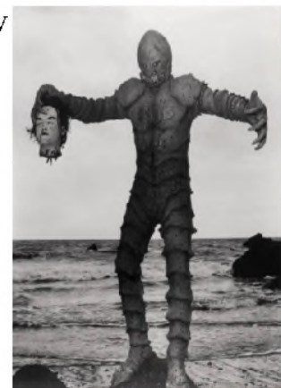
Illustration 19: Monster Of Piedras Blancas (1959)

Mummy's Hand, The (1940) Tom Tyler is excellent as Kharis, the Mummy, in the first of four B pictures from Universal. He was replaced by Lon Chaney in The Mummy's Tomb, The Mummy's Ghost, and The Mummy's Curse.