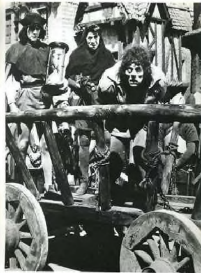
Illustration 11: Quasimodo played by Lon Chaney (1923)