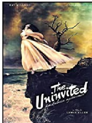
Illustration 27: The Uninvited (1944)