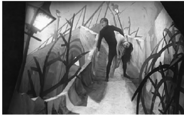
Illustration 3: Conrad Veidt and Lil Dagover in The Cabinet of Dr. Caligari

Dante's Inferno (1911) Early feature film loosely based on Dante's Divine Comedy