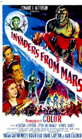
Illustration 14: Invaders From Mars (1953)