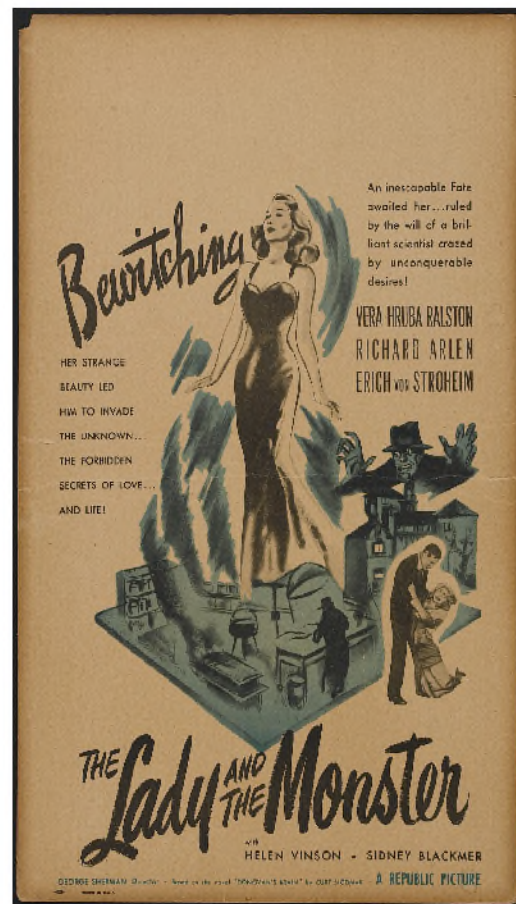
Illustration 17: The Lady And The Monster (1944)

Maria Martin, Or Murder In The Red Barn ( 1935) Tod Slaughter Spent much of his career on stage in a series of blood and thunder melodramas. His wonderfully hammy acting style is a treat in this and other titles such as Sweeny Todd.