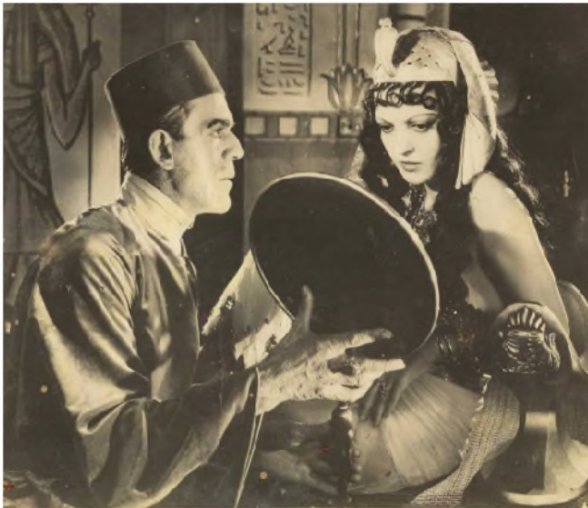
Illustration 18: The Mummy (1932)

Love At First Bite (1979) Dracula comedy.