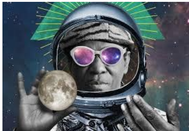
Jazz Fantasia/Jazz in Space