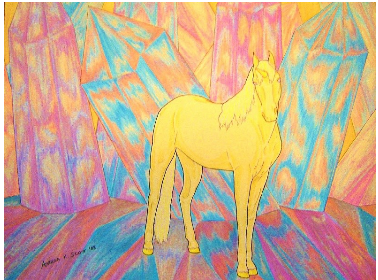
Crystal Effect — Angela K. Scott

If you have found yourself in similar situations you have SFOL - Science Fiction Over Load. SFOL is the condition a fan of SF has when they