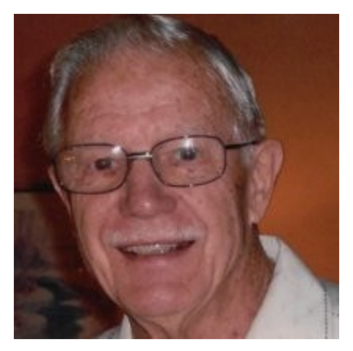
Ray Cummings, from his obituary

In a food processor with a flat blade, chop the herbs, cheese, and garlic by pulsing several times. You could add different herbs to taste. Slowly add the butter in small pieces through the portal, alternating with drizzles of olive oil. This came out very green, smooth, and tastes lovely on the vegetables and rolls.