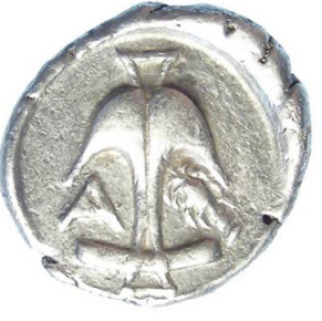
Apollonia Pontica, Thrace, AR Drachm, 450-400 BC