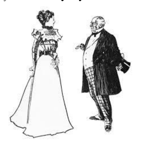
February 13: BC Family Day

February 14: Valentine's Day . Folk etymology has led to this day being called 'Feast of Vali' in modern Asatru, or Feast of Love , a Blót to Freyja as goddess of love and sexual desire. Exchange cards (or stones) inscribed with runes to loved ones. Time to renew vows, and a good time for marriages/handfastings. Recommended lore: Poetic Edda, Svipdagsmál (lay of Svipdag)