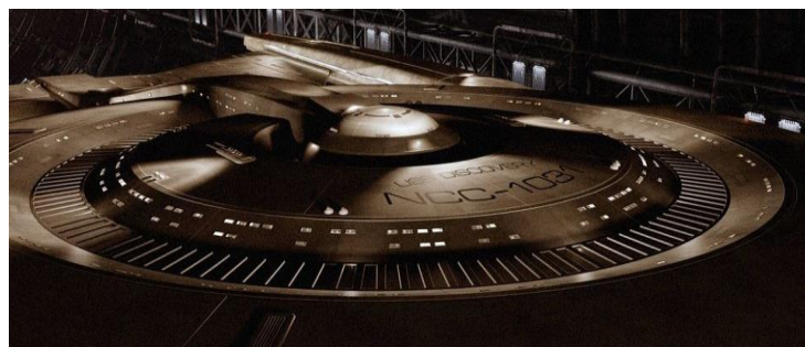
U.S.S. Discovery exits spacedock; the new series Star Trek: Discovery launches in January 2017

Visit MonSFFA on the Web / Visitez l'AMonSFF sur internet: www.MonSFFA.ca